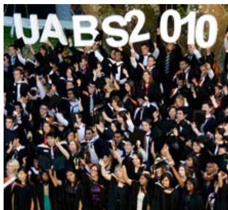
Business school graduates celebrate their success