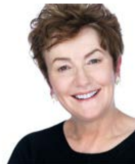
Professor Linda Colley

The British Monarchy will come under scrutiny in this year's Robb Lectures series presented by British historian Sir David Nicholas Cannadine and Professor Linda Colley, an historian of Britain, empire and nationalism, both of whom currently hold professorial positions at Princeton University.