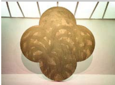
Installation shot of Lion , 1985, 90" quatrefoil,