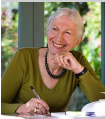
Dame Anne Salmond

Distinguished Professor Dame Anne Salmond DBE, CBE, FNAS, FRSNZ, FBA has been confirmed as guest speaker for the 2010 Distinguished Alumni Awards Dinner, to be held on Friday 5 March 2010.