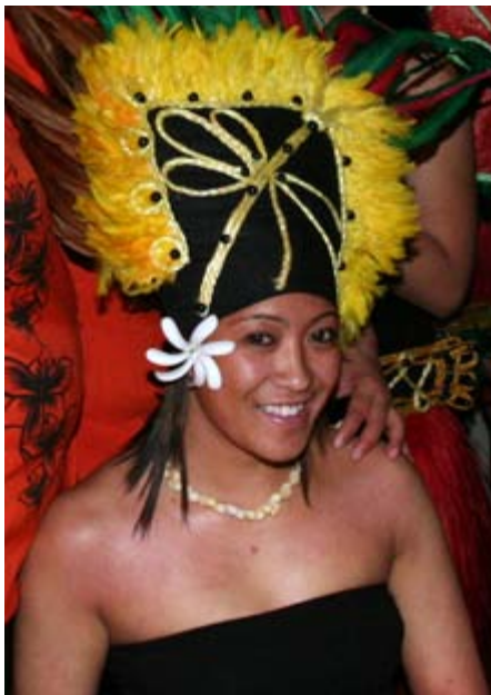
Performer from the Cook Islands Tuoro group

at the event on 26 November, Hon Georgina Te Heuheu, told the 150 guests that as Auckland alumni and as Pacific alumni "your views but, more importantly, your actions will be profoundly influential in shaping our national identity".