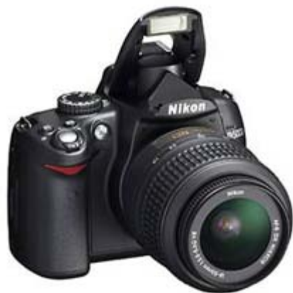
First prize, a Nikon D5000

The first University of Auckland alumni photography competition runs from October 1 to October 23. All of our graduates are eligible to enter and the prizes include a Nikon D5000 DSLR camera and a course on photography from The Centre for Continuing Education.