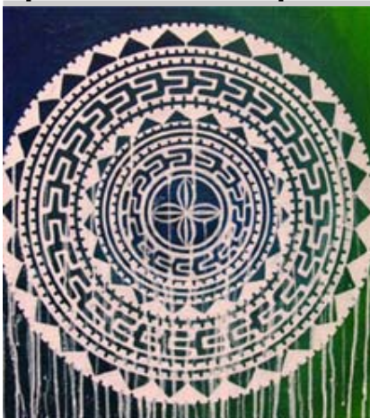
Artwork: Ellie Fa'amauri Urban Connection - Acrylic on Canvas 920 x

Artist, curator and Auckland alumnus Giles Peterson is presenting the first exhibition of contemporary Melanesian art with a region wide focus to show in Auckland.