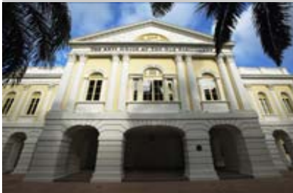
The Arts House, Singapore