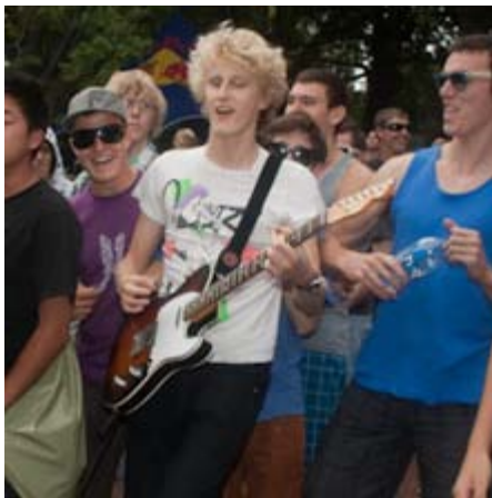
Bang Bang Eche guitarist joins the crowd during their Summer Series show