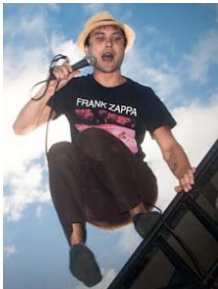
The Mint Chicks at the bFM Summer Series