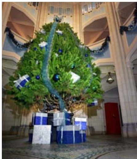
Christmas decorations in the Clocktower