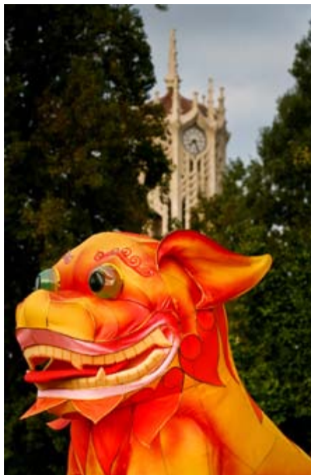
The Auckland Lantern Festival, supported by the University, takes place 26-28 February. More details below.