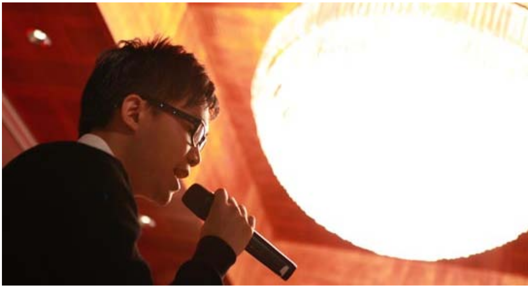
Singer from acapella group Zense, who entertained alumni and friends in Hong Kong

We'd like to thank everyone who attended our international events last month, in London, Beijing, Hong Kong and Shanghai.