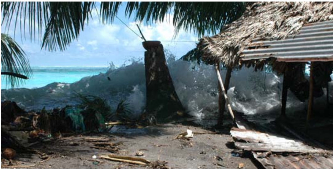
High waves wash over the island of Takuu and flood a classroom, photo by Jeffrey Holdaway

The feature documentary There Once was an Island: Te Henua e Nnoho directed by Elam graduate and Fulbright scholar Briar March and produced by University of Auckland staff member and FTVMS alumnus Lyn Collie will have its NZ premiere in Auckland at the New Zealand International Film Festival later this month.