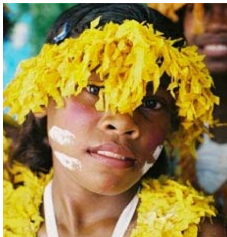
Takuu girl dressed to perform a traditional dance