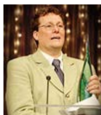
Sir Richard Taylor, 2012 New Zealander of the Year

Nominations are being sought for the 2012 New Zealander of the Year Awards. This is your chance to nominate a Kiwi or community that inspires you.