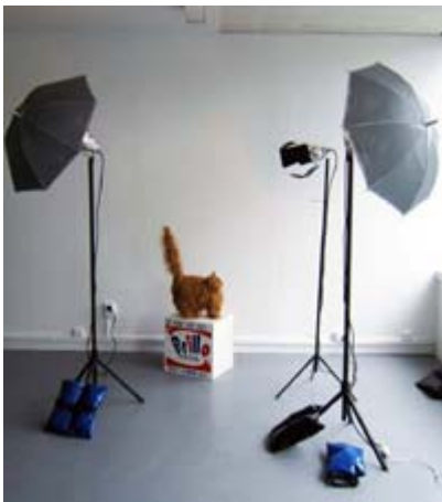
Studio Mock-Up by Erica Van Zon (Cat from Breakfast at Tiffany's, I shot Andy Warhol Brillo Box with Studio lighting) mixed media

Staff and students from the Elam School of Fine Arts are gearing up for Elam Open Days 2007, an annual, weekend-long art extravaganza showcasing the selected works of more than 120 final year undergraduates and postgraduates.