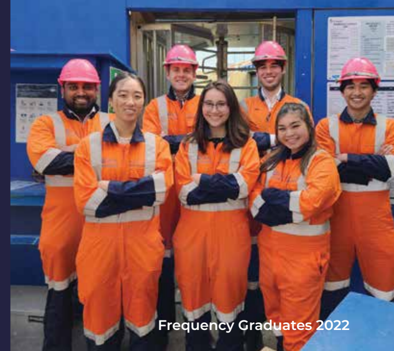
Frequency Graduates 2022