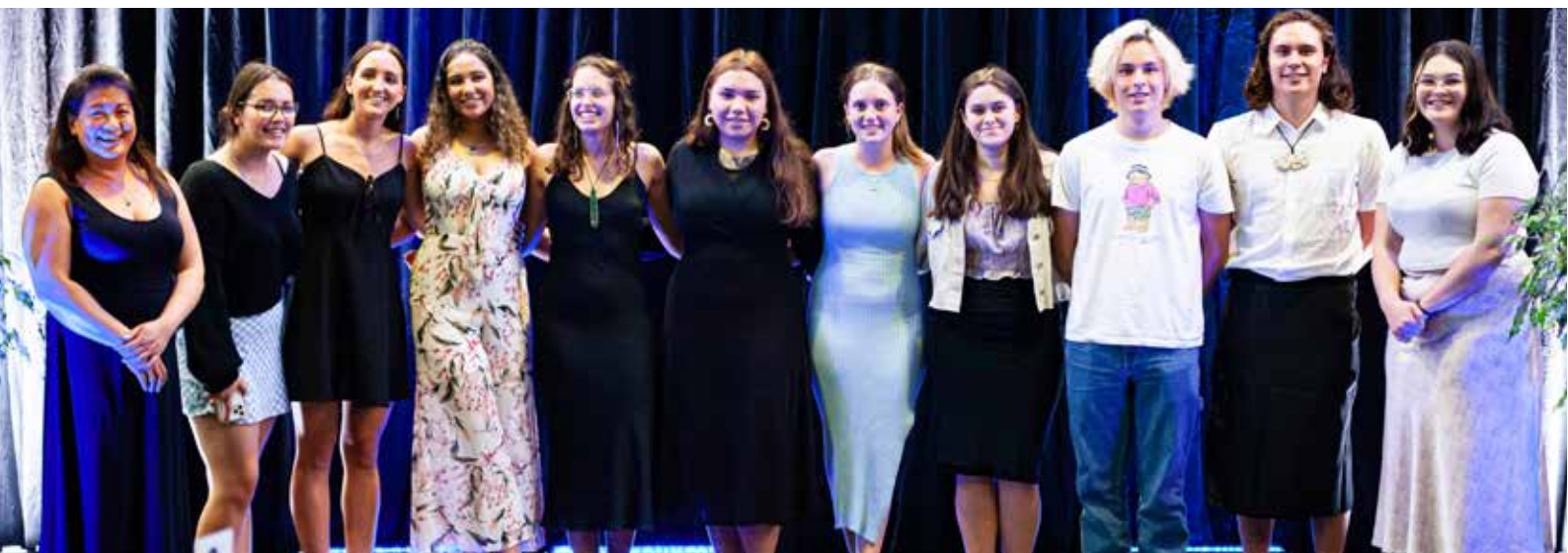
Whakapiki Ake 2021 Dinner celebrates student and whanau success to beginning the tertiary journey towards becoming a future Māori health professional.