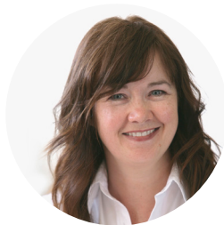
PROFESSOR NUALA GREGORY

Contact us to learn more about your creative future.