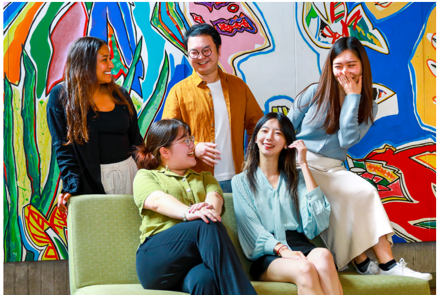
Creative Arts and Industries International Student Mentors 2023.