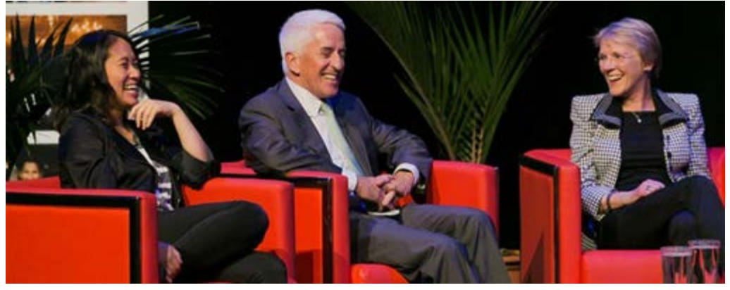
Some of the 2014 Distinguished Alumni at last year's Auckland Live!