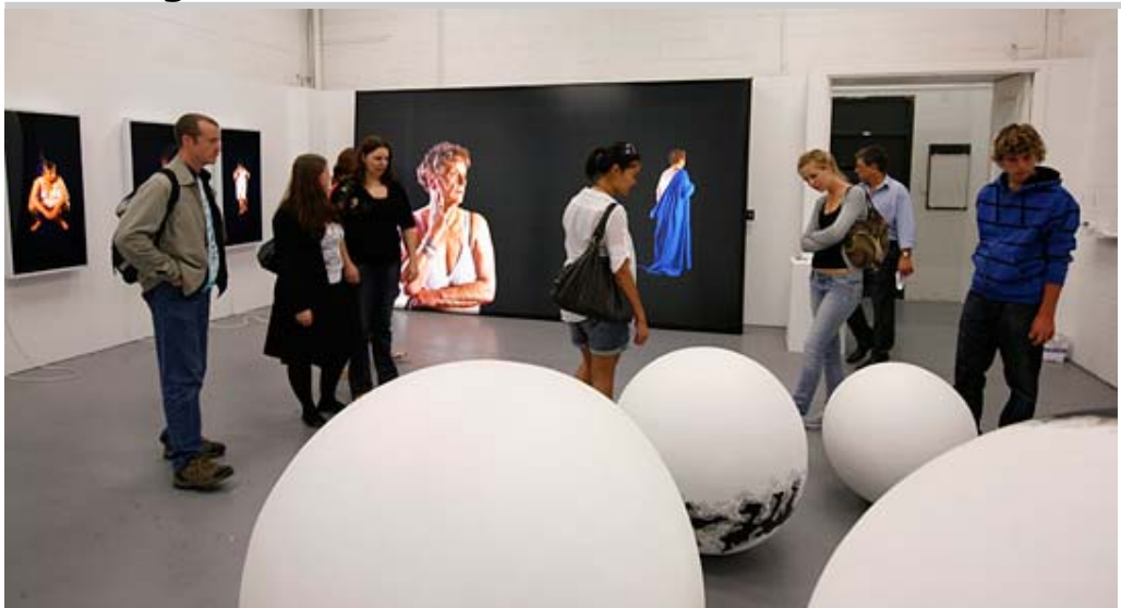
Elam Open Days 2008

The dates have been set for one of the most anticipated events on Auckland's visual arts calendar for 2009.