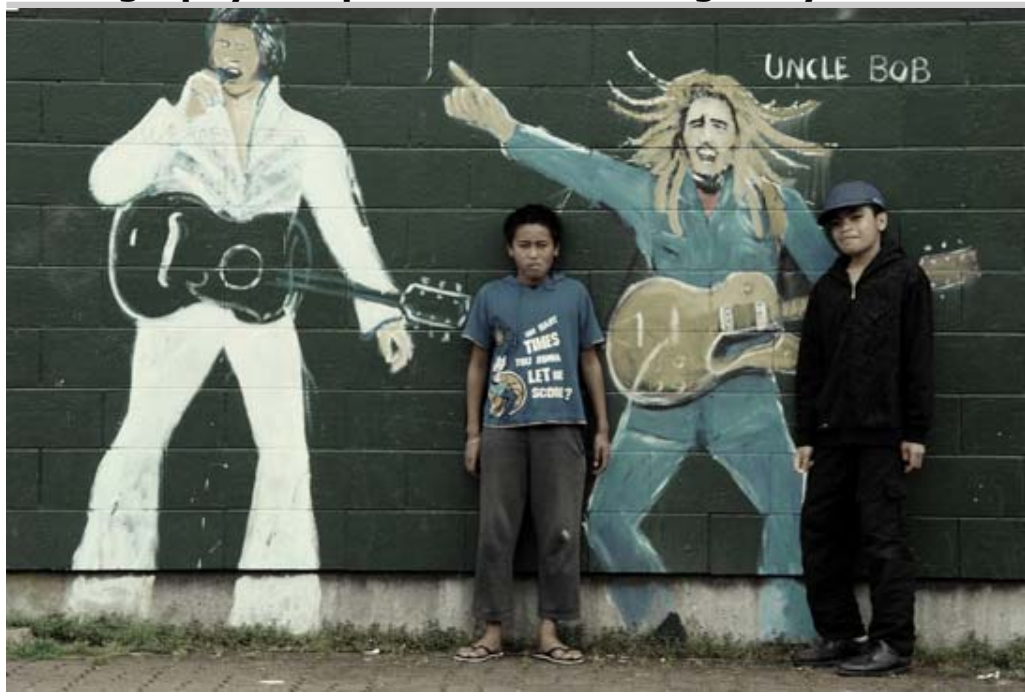
Boys in the Hood

We received hundreds of entries to our Alumni Photography Competition, which launched last month. We'd like to congratulate all entrants on the high standard of photographs submitted.