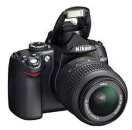
First prize, a Nikon D5000

The first University of Auckland alumni photography competition runs from October 1 to October 23. All of our graduates are eligible to enter and the prizes include a Nikon D5000 DSLR camera and a course on photography from The Centre for Continuing Education.