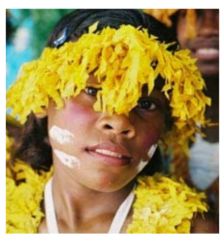
Takuu girl dressed to perform a traditional dance