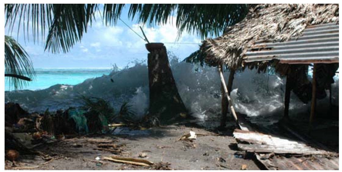
High waves wash over the island of Takuu and flood a classroom

The feature documentary There Once was an Island: Te Henua e Nnoho directed by Elam graduate and Fulbright scholar Briar March and produced by University of Auckland staff member and FTVMS alumnus Lyn Collie will have its NZ premiere in Auckland at the New Zealand International Film Festival later this month.