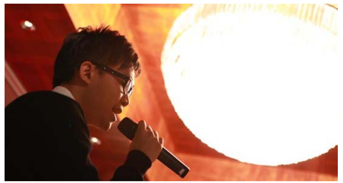
Singer from acapella group Zense, who entertained alumni and friends in Hong Kong

We'd like to thank everyone who attended our international events last month, in London, Beijing, Hong Kong and Shanghai.