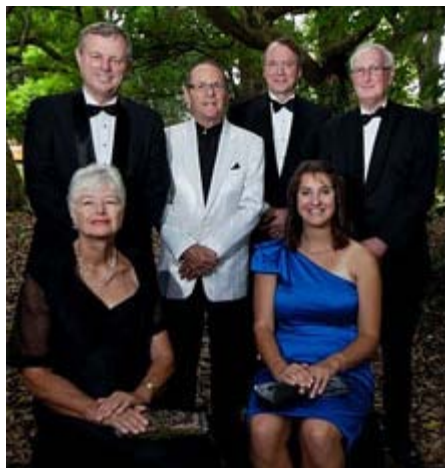
2011 Distinguished Alumni