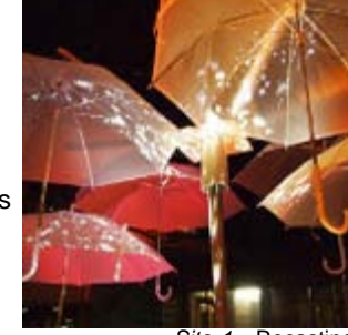
Site 1 - Recasting

NICAI students have created installations and events that will feature as part of Auckland's Fan Trail – the walking route from the waterfront to Eden Park stadium.