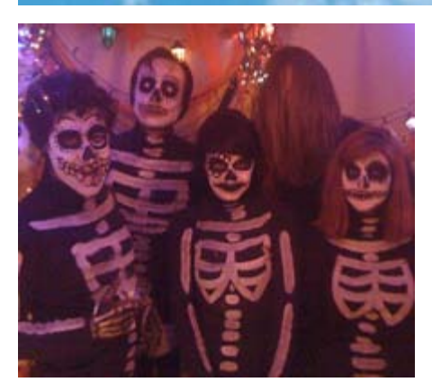
The Drab Doo Riffs, playing at the 95bFM Summer Series