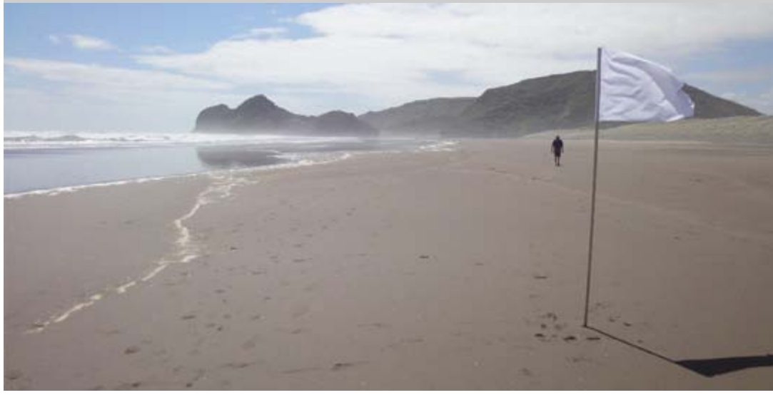
White Night (test image) by Simon Glaister

The prestigious Auckland Arts Festival 2011 will serve as a showcase for the creative talents of The University of Auckland's National Institute of Creative Arts and Industries (NICAI). Members