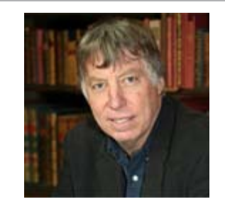
The Classical in Classical Antiquity