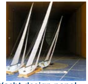
Yacht design panel