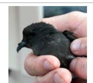
Hope for critically endangered species

Evidence that the critically endangered New Zealand storm petrel is breeding on islands in the Hauraki Gulf has been discovered.