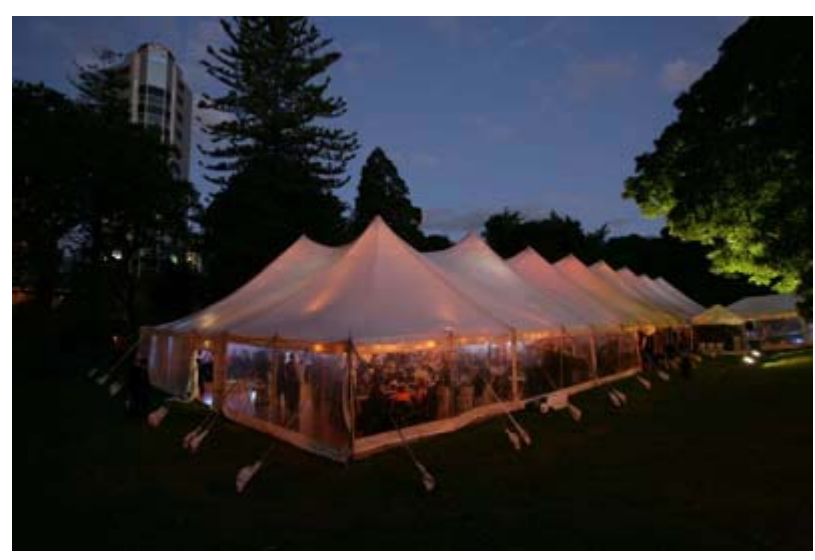
You can <u>read a report of the event</u> and <u>view our photo</u> gallery on the alumni and friends website.