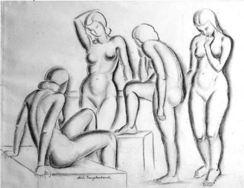
Four Nudes/ Studio Studies , 1947, Charcoal, conte on Paper, Whangarei Art

Younghusband's complex body of work includes themes from Māori mythology, religious symbolism, allegory, and modern life depicted in styles which range from cubism through symbolist surrealism to conventional landscape. The exhibition is free and is at the Gus Fisher Gallery 15 February - 8 March.