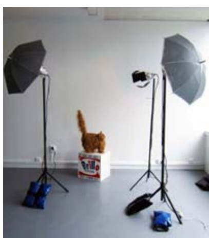
Studio Mock-Up by Erica Van Zon (Cat from Breakfast at Tiffany's, I shot Andy Warhol Brillo Box with Studio lighting) mixed media

Staff and students from the Elam School of Fine Arts are gearing up for Elam Open Days 2007, an annual, weekend-long art extravaganza showcasing the selected works of more than 120 final year undergraduates and postgraduates.