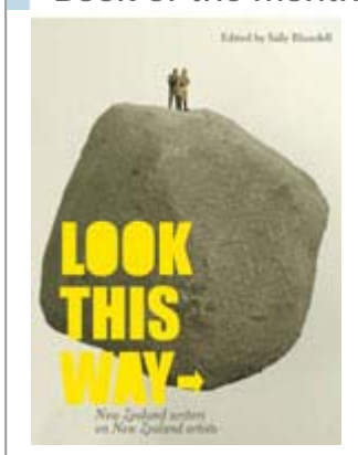
Look This Way: New Zealand Writers on New Zealand Artists

Why does a particular work of art seize your attention? Here, 17 writers answer this seemingly simple question, each writing on a favourite artist. They tell stories, find treasures, make connections, but above all look hard at the art works, while inviting the reader to share their perspective.