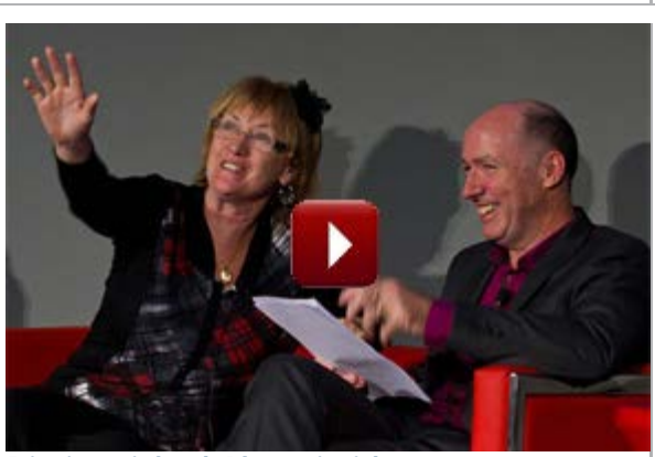
Distinguished Alumni video

More about The Blue Coat Download the discount form