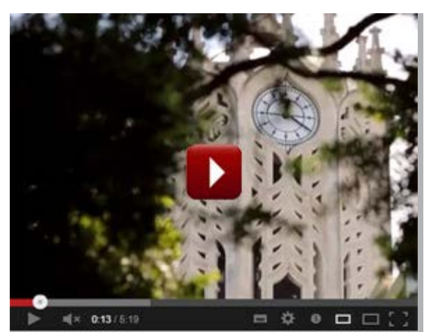
History of the ClockTower

This May The University of Auckland will turn 130 years old. In the lead up to this milestone we will be running a series of videos about the history of the university. The first in the series explores the controversial origins and architecture of one of our most iconic buildings.