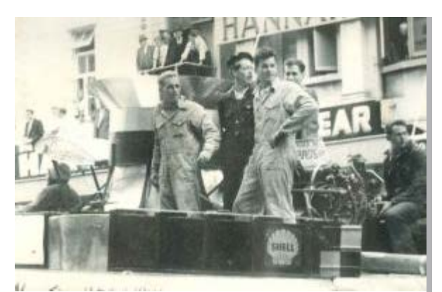
Ardmore Engineers 50 Year Reunion

Select Alumni and friends at the top of the page and watch the price change!