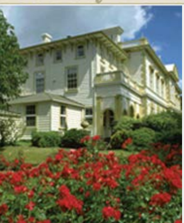
Old Government House, venue for this year's Christmas event

Personalised invitations to attend the Distinguished Alumni Awards Dinner on Friday 1 March 2013 will be posted to Society members shortly. Don't forget that members can attend the Dinner and Auckland Live! 20/20 Vision: Fast Forward Thinking at discounted ticket prices and can sit together.