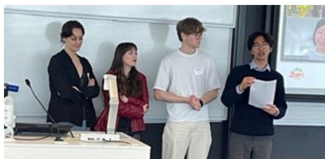
Students presenting at the Asia Savvy Challenge