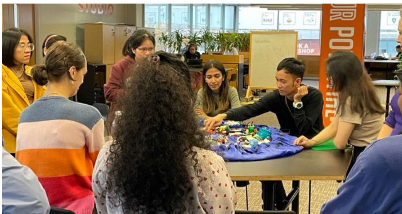
Asia Savvy LEGO Serious Play workshop participants, May 2023

NZAI engages widely with corporate, government and other stakeholders.