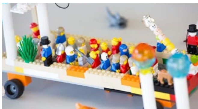
Student creation at the LEGO Serious Play workshop

The idea for LEGO Serious Play was developed in Switzerland by two academics in conjunction with the LEGO CEO in the 1990s. It is a style of learning, applicable over a variety of themes, designed to improve your creative thinking and communication skills.