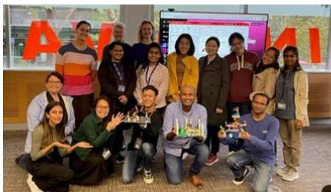
Participants at the LEGO Serious Play workshop

Thanks to everyone who attended the workshop where we used our LEGO to represent our interpretations of what it takes to be open to other cultures; followed by what barriers look like to having these competencies. Each group created wonderful LEGO representations of using the competencies to overcome the barriers.