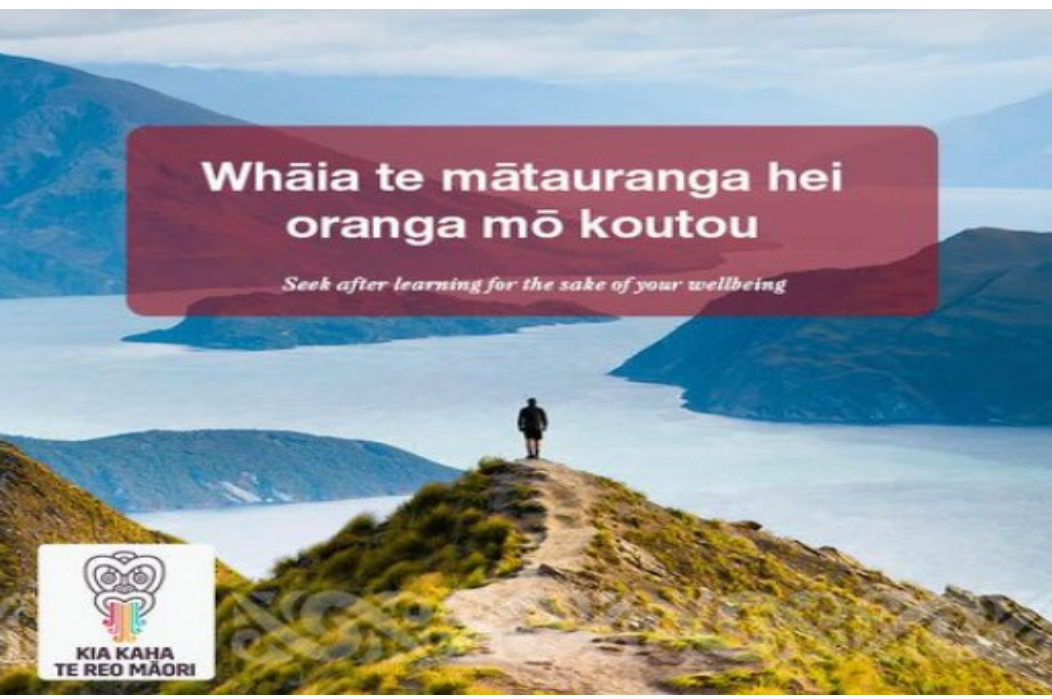
Thank you for taking the time to read your HSW Newsletter Keep Well