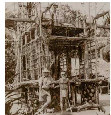
'Photograph album: scenes from British Solomon Islands Protectorate, ca1939–1949'. WPHC 10/XV/325/009.

The Solomons were included in the jurisdiction of the WPHC in 1877, but the British Solomon Islands Protectorate was not established until 1893. This name was changed to 'Solomon Islands' in 1975, when the country gained internal self-government in 1976. The Solomons became fully independent in 1978.