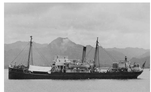
"Awahou", M.V.: - Survey and Registration of. 1946.' WPHC 9/II/F.46/17/8.