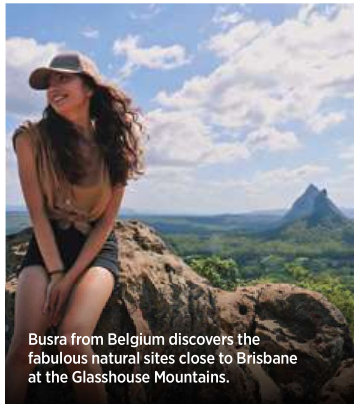
Busra from Belgium discovers the fabulous natural sites close to Brisbane at the Glasshouse Mountains.

study.uq.edu.au/university-life/living-in-brisbane/cost-living