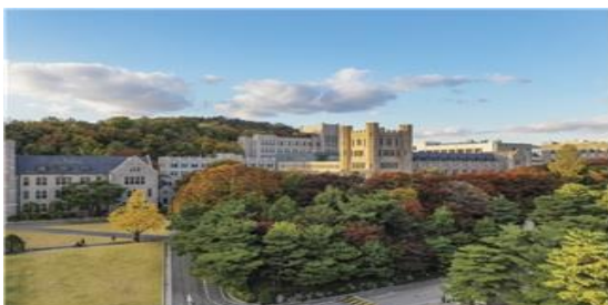
Global Services Center (GSC)

※All supporting documents MUST be uploaded online in English or with English translations.